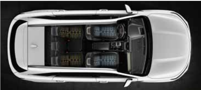
HEATED AND VENTILATED SEATS

Assurance all round: this intuitive system combines four wide-angle images from cameras on the front, rear and sides of the vehicle to give you a comprehensive bird's-eye view of the space around the Sorento while parking or moving at speeds below 20 km/h.