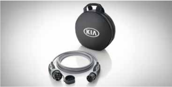
CHARGING CABLE, MODE 3

Conveniently deploy and retract this fully electric, high quality tow bar via a switch in the trunk.