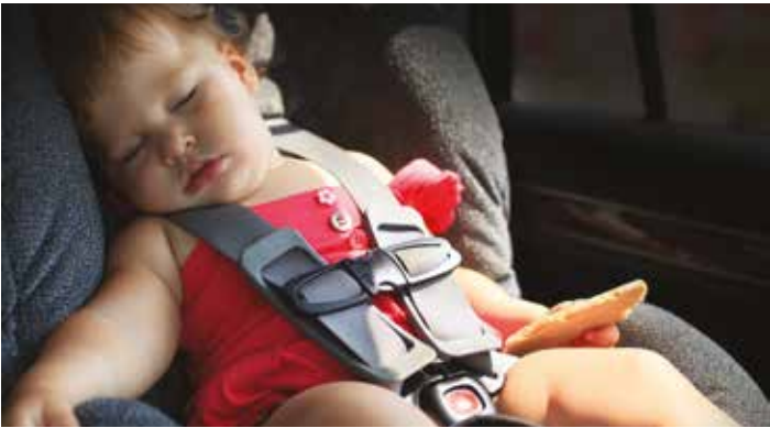
REAR OCCUPANT ALERT (ROA)

If your airbag is fired in response to a primary collision, a signal is immediately sent to the Electronic Stability Control system to brake your vehicle. MCB applies your brakes to prevent a subsequent collision or mitigate its impact.