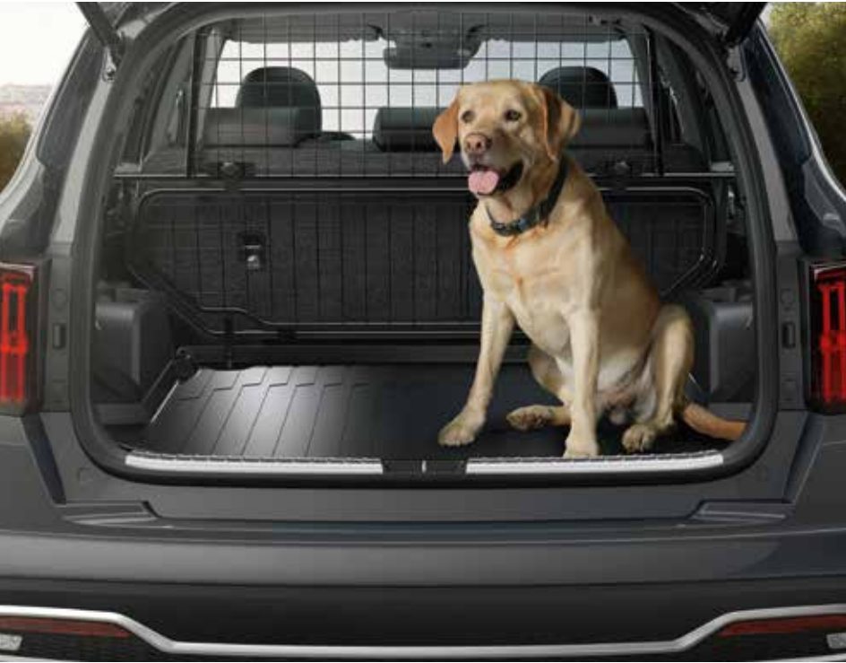
DOG GUARD, UPPER AND LOWER FRAME

When going your own way is seizing new challenges, seeking new adventures or sizing up what the day will bring, then the new Sorento is ready, able and always willing with a whole range of Kia Genuine Accessories to match. From time away, to time in the city, to time for some fun, our selection of high-quality accessories offers clever solutions and special features to personalize your Sorento and make your driving experience a real pleasure.