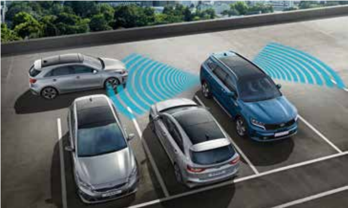
REAR CROSS TRAFFIC COLLISION AVOIDANCE ASSIST (RCCA)

When you choose to use ISLA, the system uses a camera to read speed limit signs along the road, and displays them beside the speedometer and on the navigation screen. You can then decide to set your speed to the road speed limit or override it.