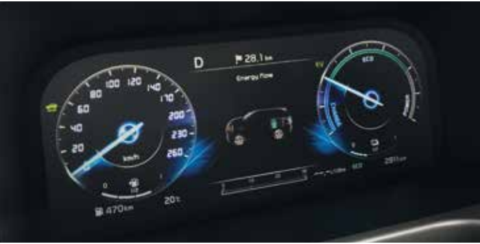
12.3" FULLY DIGITAL TFT INSTRUMENT CLUSTER

The system's regenerative braking takes advantage of every decrease in vehicle speed, capturing energy and storing it in the battery for future use.