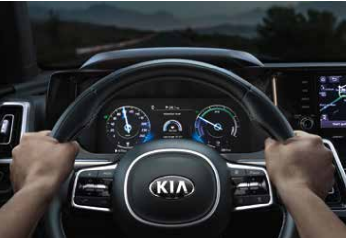
DRIVER ATTENTION WARNING (DAW)

When conditions allow, the Sorento will turn on its high beams automatically. When the camera in the windscreen detects the headlights of an oncoming vehicle at night, the High Beam Assist system automatically switches to low beam to avoid dazzling other drivers.