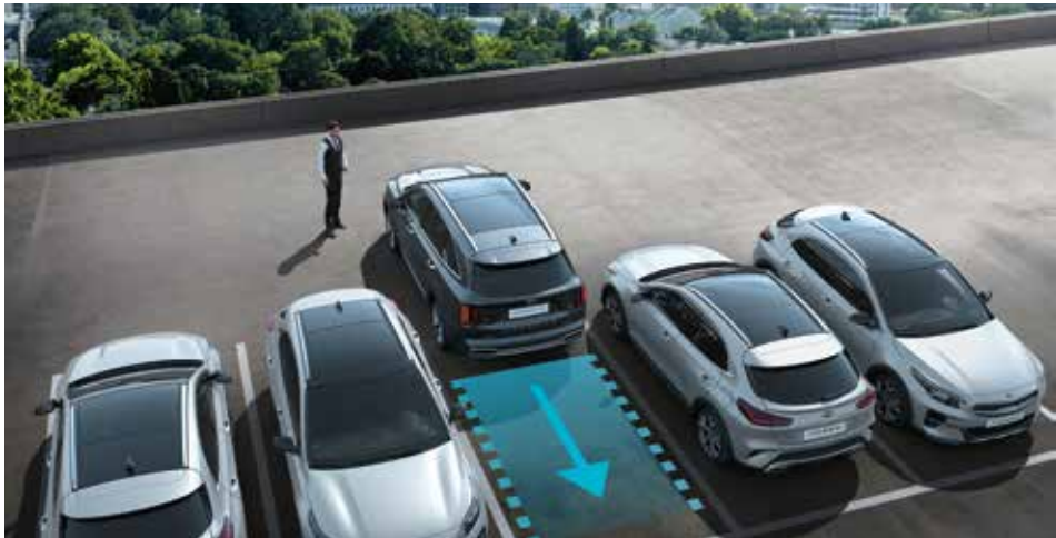
REMOTE SMART PARKING ASSIST* (RSPA-ENTRY)

The new Kia Sorento helps you stay aware of what is happening around you and of other vehicles, enhancing your comfort and safety on both short and longer journeys.