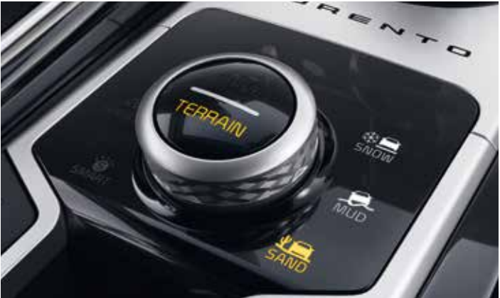
TERRAIN MODE SELECT (TMS)

Both the Sorento 1.6 T-GDi HEV and 1.6 T-GDi PHEV come with six-speed automatic transmission, ensuring a smooth transition between gear changes.