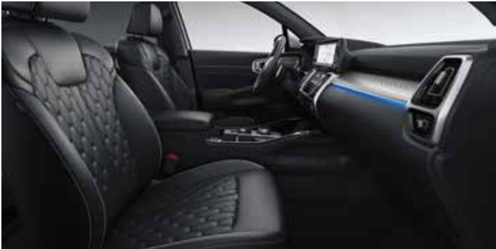
BLACK QUILTED NAPPA LEATHER WITH GREY STITCHING AND PIPING