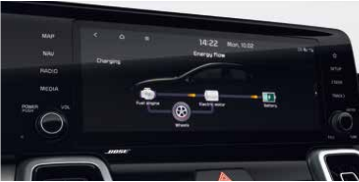
10.25" NAVIGATION DISPLAY

An intelligently designed, customizable supervision cluster provides temperature information, tyre pressure alerts and other essential vehicle and trip information. It also displays the status of the hybrid charging system, including fuel and battery levels and use. Its high-resolution screen makes it easy to read a wealth of information at a glance.