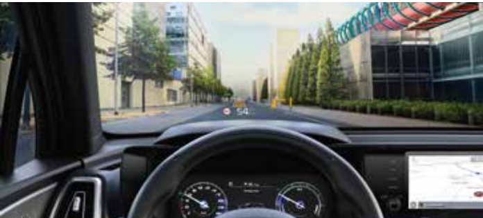
HEAD-UP DISPLAY (HUD)

When you know the way you go, it's also great to know that your loved ones can share the Sorento experience in its ergonomically designed, spacious and comfortable cabin.