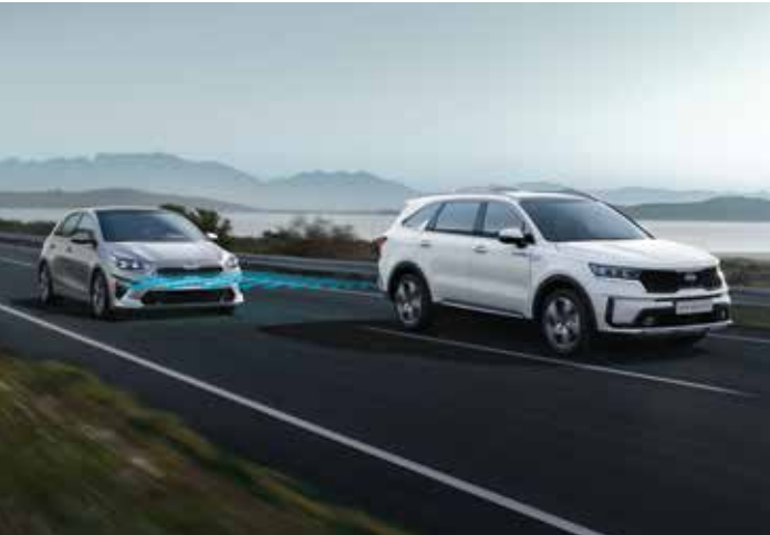
BLIND-SPOT COLLISION-AVOIDANCE ASSIST (BCA)

No one knows what the road or journey ahead can throw at us and that’s why the new Sorento comes with highly refined solutions for a safer journey.