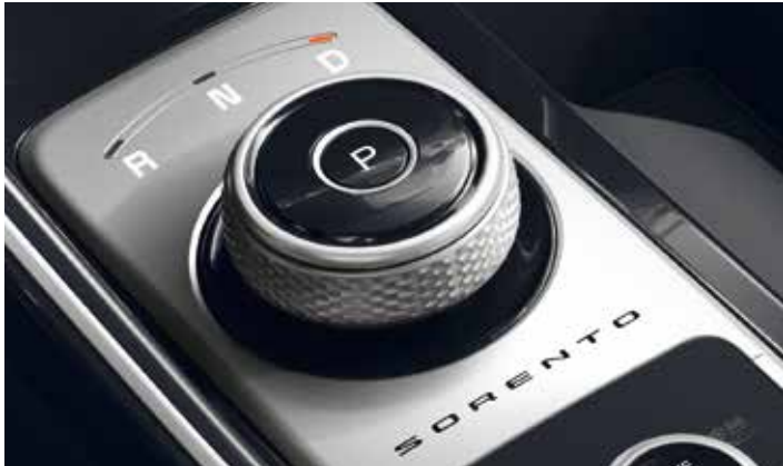
ROTARY GEAR SHIFT DIAL

The new automatic transmission offers a choice of drive modes that allow you to customize the powertrain's responses to driver inputs, enhancing your fuel economy or acceleration. The Sorento combustion diesel model offers four drive modes, Eco, Comfort, Sport and Smart, while the Sorento HEV offers Eco, Sport and Smart modes. The Drive Mode Select system also adapts the weight of the rack-mounted power steering system, for more relaxed or more immediate, engaging steering responses.