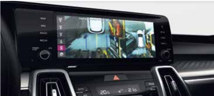
360° SURROUND VIEW MONITOR

For the perfect atmosphere, you'll find mood lighting in the doors and under the dash, with a choice of seven core colours and up to 64 other colours to suit your mood and make every trip as peaceful or exciting as you want to make it.