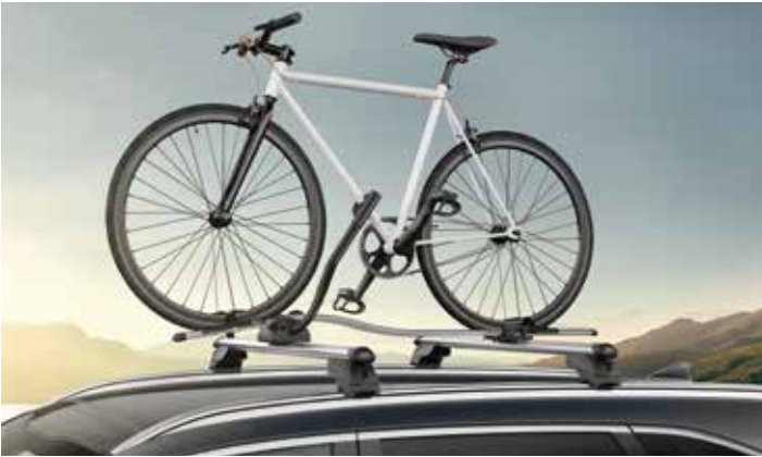
CROSS BARS, ALUMINIUM & BIKE CARRIER PRO

Effective protection and exclusive styling: ideal for guarding the inner sill of your Sorento's load area from damage.