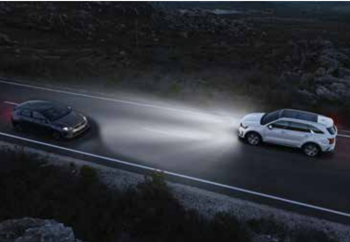
HIGH BEAM ASSIST (HBA)

Whether short or long, it's good to know that on every journey you take, your Kia Sorento is helping to keep you and your passengers safe and secure.