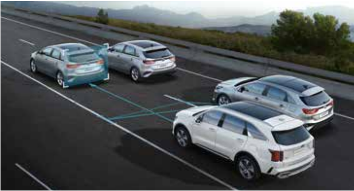
LANE FOLLOWING ASSIST (LFA)

DAW monitors your steering wheel, indicator and acceleration patterns and warns you if you're losing concentration. For example, when in traffic, if the car in front of you drives away and you don't move it will alert you; or if you're showing signs of drowsiness, DAW will encourage you to take a break.