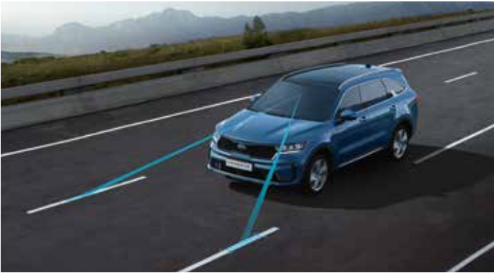
LANE KEEPING ASSIST (LKA)

Using camera and radar, SCC maintains your set speed, ensuring a safe distance between you and the vehicle ahead. It also controls acceleration and deceleration to ensure your vehicle stops when the vehicle ahead does and then moves off when the other vehicle moves again. What's more, SCC is navigation-assisted and uses ADAS map information, allowing it to auto-decelerate your speed on any bends for added safety and to keep within the speed limit.