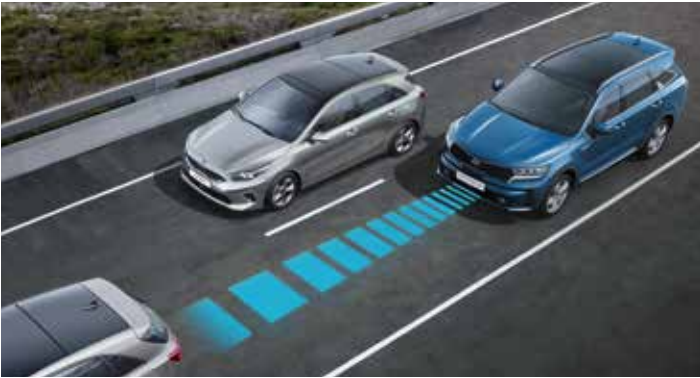
SMART CRUISE CONTROL WITH STOP & GO (SCC W/S&G) AND NSCC

Kia's level 2 autonomous driving system takes a giant leap towards semi-automated driving. In collaboration with Smart Cruise Control, LFA controls acceleration, braking and steering depending on the vehicles in front. This makes driving in traffic jams easier and safer. The system uses camera and radar sensors to maintain a safe distance to the preceding vehicle and monitors road markings to keep your car in the centre of your lane. LFA works between 0 and 180 km/h.