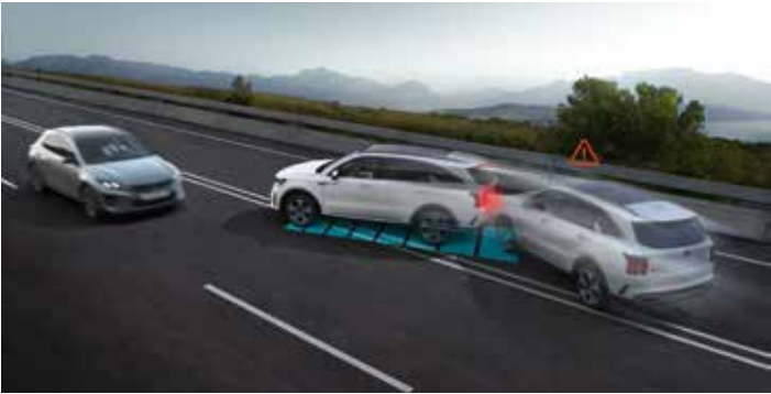
MULTI-COLLISION BRAKE (MCB)

Designed to help prevent rear passengers from exiting the vehicle when the system detects potential hazards approaching. If that happens, the system will engage the power locks, and give an audible and visual alert.