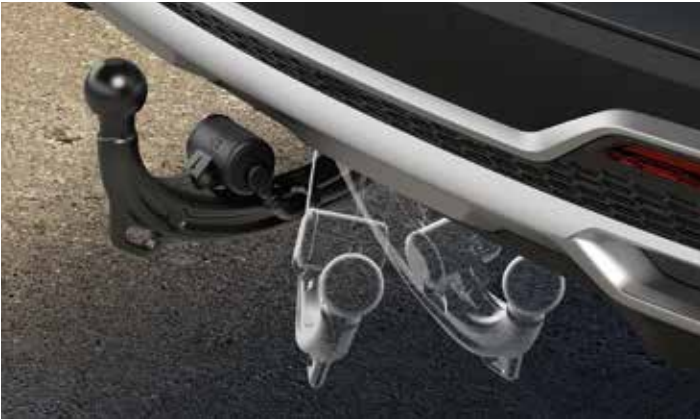
TOW BAR, RETRACTABLE

Transport all you can possibly need with these light but strong cross bars and be ensured to load and unload your bike with ease.