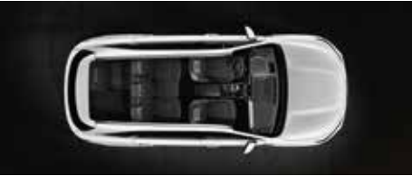
3rd row partially folded

The Sorento can be transformed quickly from five seats to seven seats as well as easily reconfigured to create a generous luggage hauler or explorer with up to 910 litres of luggage space. For easy folding of the second-row backrests straight from the tailgate area, you'll find two one-touch remote-folding buttons, one for the left and one for the right, to make it quick and simple.