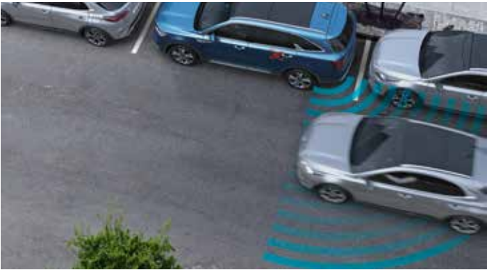
SAFE EXIT ASSIST (SEA)

Designed to improve visibility for blind spots, the BVM uses side cameras so that when you indicate left or right, your instrument cluster will show the view of the road in your blind spot. Indicate left and it will show you the rear view down your left-hand side; indicate right and it will show the right-side view.