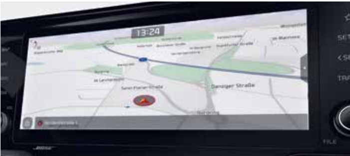
10.25" NAVIGATION SYSTEM

From the moment you sit inside the new Kia Sorento you'll discover an array of the latest information and entertainment technology, designed to put you in complete control for whatever adventures lie ahead.