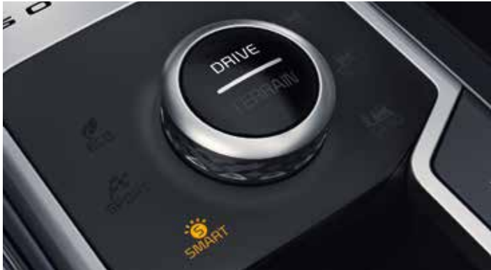
DRIVE MODE SELECT (DMS)

Refined, chrome-finished paddle shifters coordinate with the rest of the cabin's design, and allow you to change gears swiftly without taking your hands off the steering wheel. They also boost driving dynamics, making it effortless to increase torque faster, while staying in control.