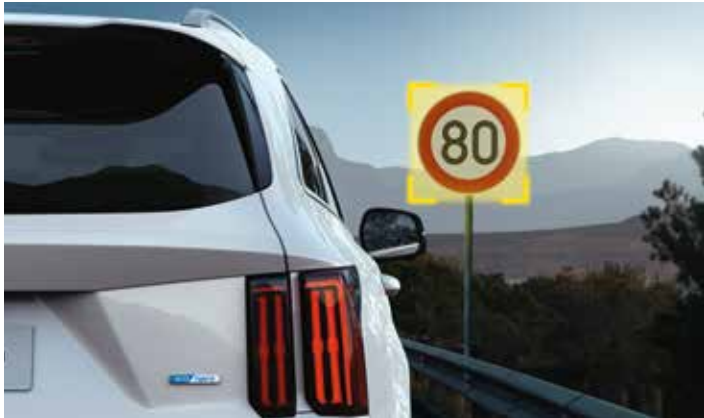
INTELLIGENT SPEED LIMIT ASSIST (ISLA)

Remote Smart Parking Assist (RSPA) is a convenient parking system that makes it easier when parking your vehicle or exiting from a parking spot by automatically parking or manoeuvring the vehicle. It is also possible to remotely move your vehicle forwards and backwards while standing outside, using a key fob.