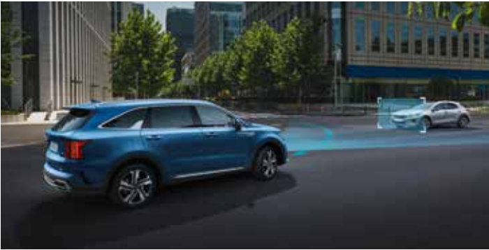
FORWARD COLLISION-AVOIDANCE ASSIST (FCA)

Uses ultrasonic sensors that are designed to detect children or pets in the second or third row, and gives visual and audible alerts if it detects movement inside, before and after the vehicle has been locked.