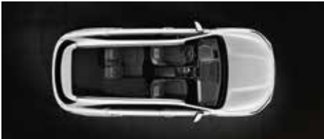
2nd row partially folded (5-seater)

Whatever you've got planned and whatever you want to carry, the Sorento comes well prepared.