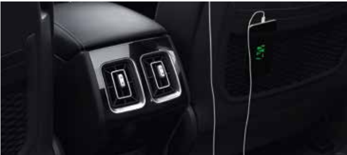
USB PORTS AND POWER FOR ALL

Experience the very best in-car entertainment with 12 speakers, an external amplifier and cutting-edge technology. Transform any stereo or multichannel audio source into an astounding surround sound experience.