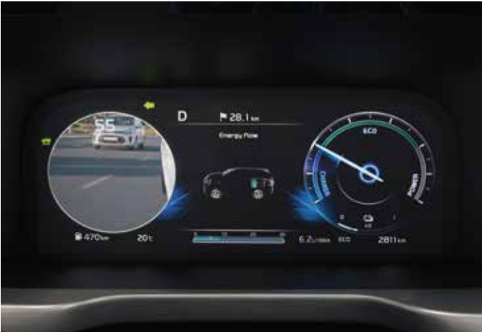
BLIND-SPOT VIEW MONITOR (BVM)

When you want to change lane, the Blind-Spot Collision-Avoidance Assist system detects any vehicle(s) in your blind spot and alerts you with a warning symbol in your side mirror and on the head-up display inside the car. Should you start to change lane while a car is in your blind spot, the Sorento will automatically apply the brakes to avoid a collision, the side mirror and head-up warning symbols will flash and an audible alert will sound.